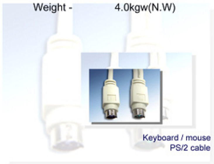
Keyboard / mouse PS/2 cable