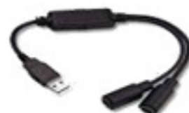
2-port PS/2 to USB Converter (MS120)