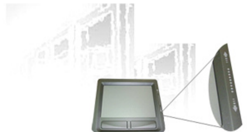
Easy to Roll up and push the Reel